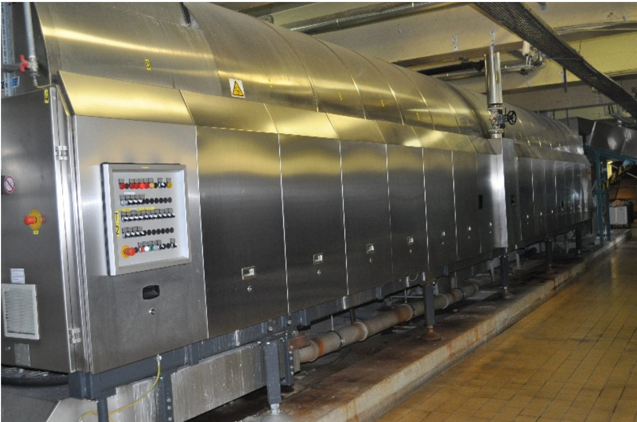
A typical CBW - this is a 50kg 14 compartment model, capable of washing up to 35 tonnes per day

Most modern high-throughput washing machines are Continuous Batch Washers (CBWs) - commonly known as "Tunnel" washers. They essentially consist of a long cylindrical tube containing a mechanism similar in action to an Archimidean screw. The screw oscillates for a period, to give the washing action, then performs a complete rotation to transfer the wash load from one section to another. Various valves enter the cylinder in places, to supply and drain water, introduce chemicals, and inject steam for heating.