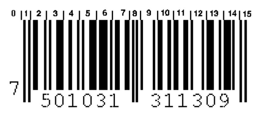
Fig. 4. Bars alignment and bar set's indexing

Guard bar sets (no. 1 and 15) delimit the bar code from both sides, and the bar set no. 8 is a middle guard bar set, which separates the manufacturer part from the product part. As you can see on the Figure 4, the first digit of the number system is represented as blank bar set, although it is still taken for the checksum calculations.